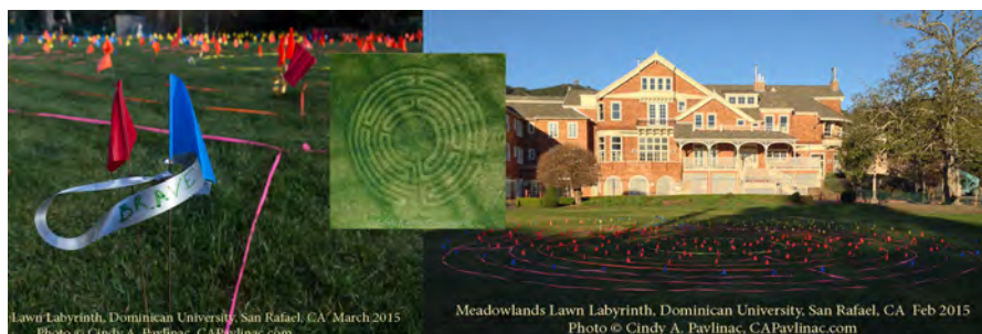
Image 2: Meadowlands Lawn Labyrinth created by Wisdom of the Labyrinth Art History students, Dominican University campus, San Rafael, CA USA, Spring 2015. © 2015 Cindy A.Pavlinac www.CAPavlinac.com. Used with permission.

As the students entered our plastic tape labyrinth, there was a profound shift from laughing at silly flappy flags to considered seriousness and genuine gratitude. Everyone was astonished at the immediate change in attitude. Afterwards we sat on the lawn and quietly shared experiences in a mood of deep respect and reverence. Each had felt an unexpected shift. Many were surprised at who came to mind to be named with a rose petal. Several moved beyond individual people and pets to include groups and other entities of the greater environment. All were shocked how a simple labyrinth walk could drop them immediately into personal pilgrimage and the inner landscape of their deep truth.